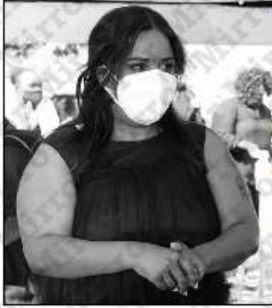
Musina Mayor Mhloti Mhlope addresses women during the Women's Month closing ceremony at Musina Show Grounds.