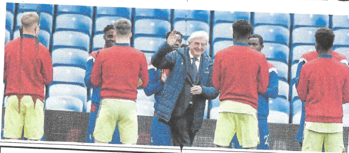
Crystal Palace manager Roy Hodgson will be in charge of Palace for the last time on Sunday against his former side Liverpool.

Roy Hodgson will be in charge of Palace for the last time on Sunday after announcing his departure from the club at age 73. - Reuters