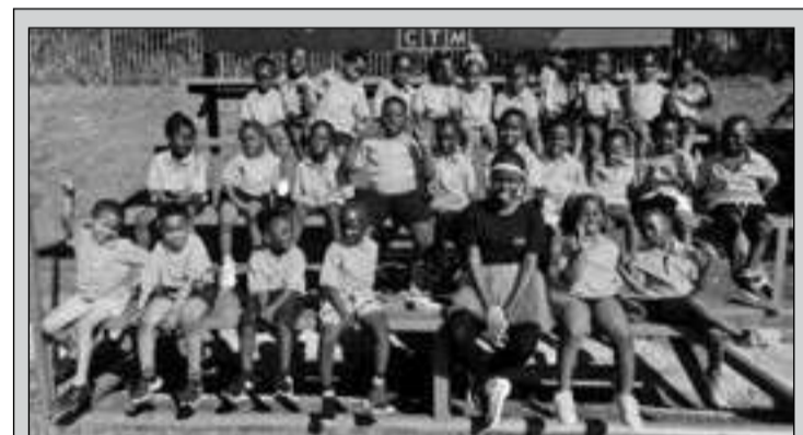
Some of the kids from Petit Day Care Centre at the CTM stadium in Thohoyandou Block F. The centre held a sports day last Wednesday as part of the Youth Day celebrations.