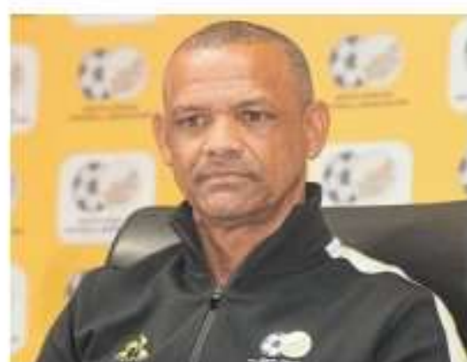
Duncan Crowie / SYDNEY SESHIBEDI/GALLO IMAGES

"As far as the areas we need to improve on, I don't think it's a technical or tactical thing, I think it's more of composure in the final third we need, to get more touches and passes going in the final third."